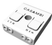
Dimmer Radio-frequenza, 85-240V